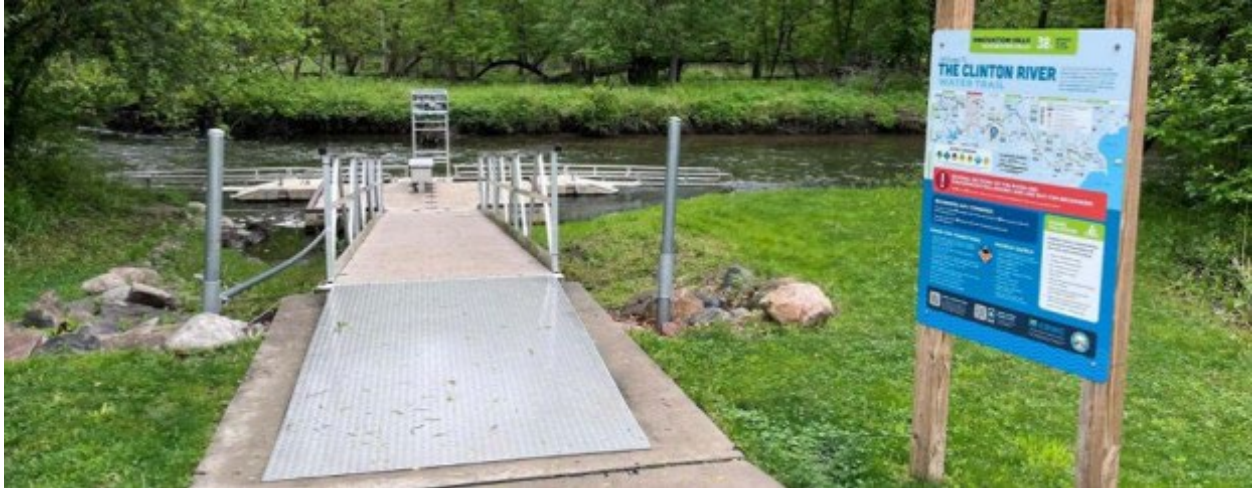
Innovation Hills Park is a 110-acre public park located along West Hamlin Road near the western edge of the of Rochester Hills. It is among 12 parks in Oakland County the CRSC will be upgrading.

Here is the list of upcoming Macomb County projects: